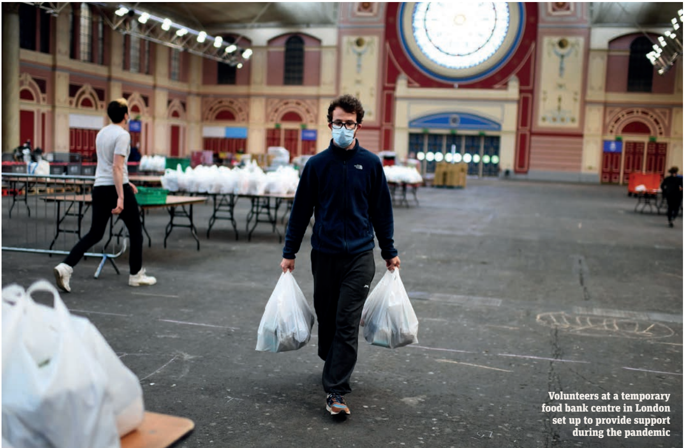
Volunteers at a temporary food bank centre in London set up to provide support during the pandemic

Across our society, we are seeing first hand the many people – often hidden in plain sight – who need a little help: those with limited social capital, without friends or family who can help with collecting their shopping and medication; people whose only social contact may have been going to the shops or seeing their GP, and for whom a chat on the phone once a week is a lifeline; those who, for all sorts of reasons, may be marginalised and living on the fringes of society. The crisis has activated our communities to step up and help like never before. Local support groups have sprung up all over the country and more than 750,000 people have joined the NHS volunteer programme. There is a can-do, action first approach to helping and it is truly inspirational.