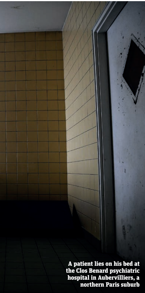
A patient lies on his bed at the Clos Benard psychiatric hospital in Aubervilliers, a northern Paris suburb