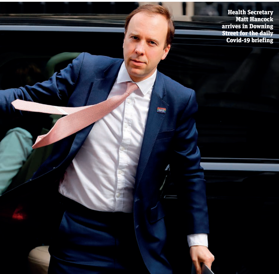
Health Secretary Matt Hancock arrives in Downing Street for the daily Covid-19 briefing

not meet the standards of scientifically credible, peer-reviewed or evidence-based therapies.