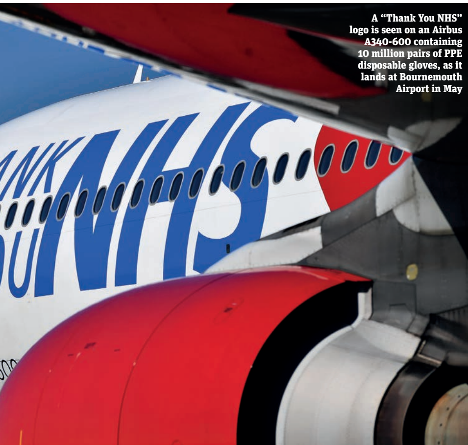
A “Thank You NHS” logo is seen on an Airbus A340-600 containing 10 million pairs of PPE disposable gloves, as it lands at Bournemouth Airport in May