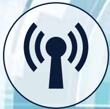
5G MOBILE INTERNET