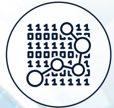
BUILDING INFO MODELLING (BIM)