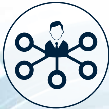
INTERNET OF THINGS (IOT)