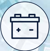
LARGE-SCALE ENERGY STORAGE